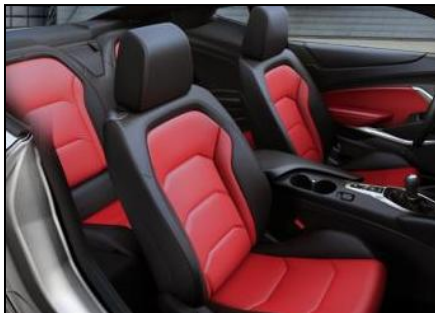
Adrenaline Red Trim Package