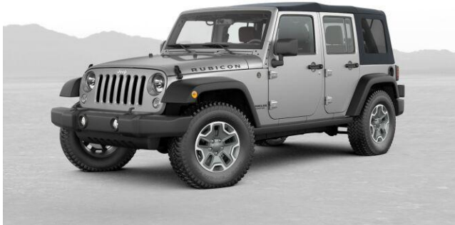
4-Door Base Price